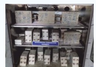
Accelerated Carbonation Induced Corrosion Study