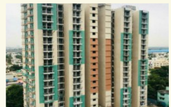
Central Revenue Quarters– CPWD, Chennai