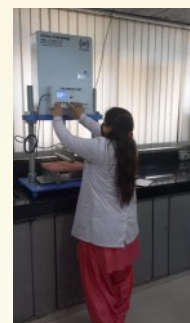
Net Transverse strength of Cement concrete tile using Flexure Testing Machine of 10kN