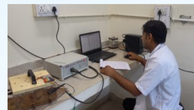
Corrosion rate measurement