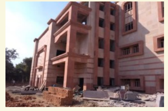
Museum at Noida- CPWD