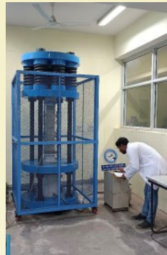
Creep testing apparatus to evaluate creep coefficient