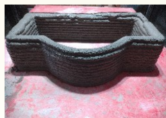
3D Printed Concrete object manufactured using indigenous developed 3D customized printer