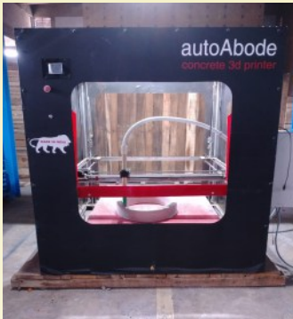
Lab scale 3D concrete printer

To enhance the experimental capability of the centre, several testing equipment related to study of cement and concrete characteristics and its behavior have been added. These equipment are procured under plan grant for different R&D and Sponsored Projects. The laboratory comprises of advance equipment for testing mechanical and durability parameter of various research projects.