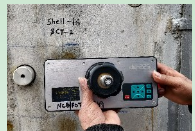
Pull-Off Test Being done to check bonding of PMM with substrate concrete