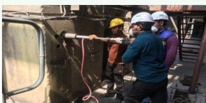
Core extraction from RCC foundation