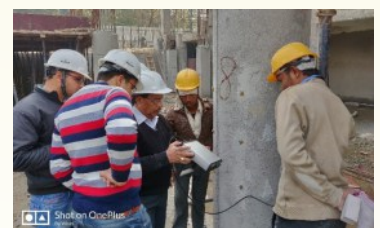
PUNDIT Lab Plus (UPV Tester) for Quality Assessment