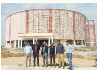
Construction of VC & Administration Building for Lala Lajpat Rai University for Veterinary and Animal Science at Hisar, Haryana