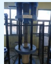
Creep testing in loaded condition