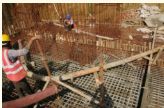
Central Public Works Dept. (Srinivaspuri, Delhi)