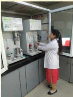
Mercury Intrusion Porosimeter test is used to study the pore size distribution and porosity of aggregate, concrete and mortar.