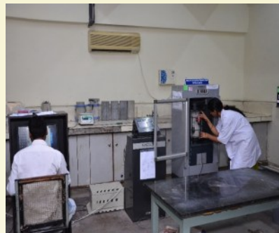
Modulus of Elasticity and Poisson's ratio determination through high precision servo controlled Compression Testing Machine-3000kN