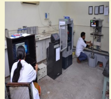
Strain Controlled Flexural Testing Machine-300kN for determination of flexural toughness of fiber reinforced concrete and crack mouth opening gauge for measurement and control of crack width in concrete samples