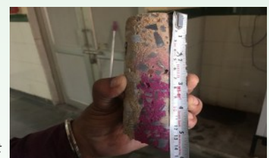
Carbonation depth being measured on freshly extracted core at site