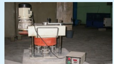
Abrasion Resistance test for Concrete