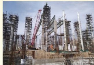
Conventional Centre in Pragati Maidan – ITPO, New Delhi