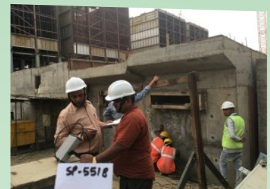
UPV test of Concrete Structure for Quality Assessment