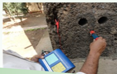
Half-cell Potential Measurement of Corrosion Damaged Structure