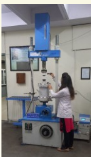
Confined Compressive strength of Concrete and Rock Specimens