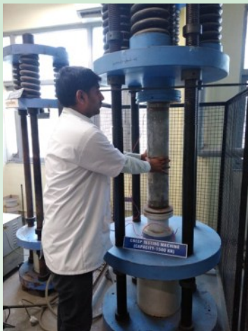
Test for Determination of Creep Coefficient (In Compression)