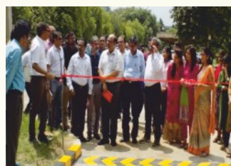
Inauguration of Trial Stretch made using Geopolymer paver blocks