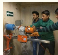
Extraction of Concrete Core of 150 mm diameter from Gallery Portion of Dam structure