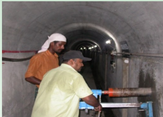
Concrete Core extraction of 150 mm diameter & 1 metre length from gallery of Gravity Dam