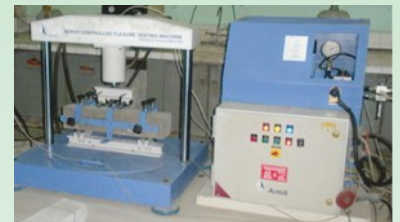
Flexure toughness test on Steel Fibre Reinforced Concrete