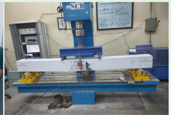
Flexural test setup for Geopolymer Reinforced Concrete Beams (In Flexure)