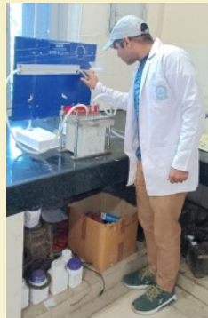
Initial surface absorption test (ISAT) apparatus to evaluate the rate of water absorption by concrete samples