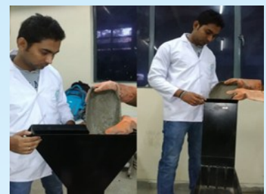
V-Funnel & L-Box Test for SCC