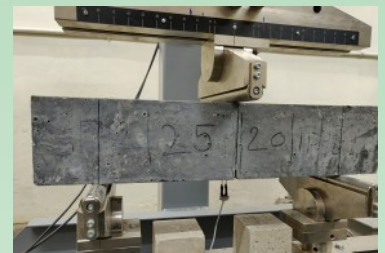
Testing of notched beam in progress for the study of fracture behaviour of High Strength Concrete