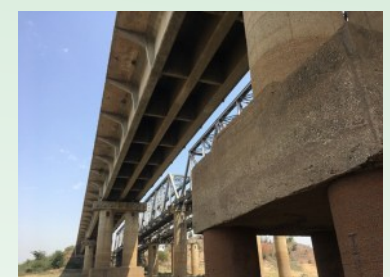
Condition Assessment of RCC Bridges