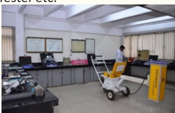
State of art Non-Destructive Testing Laboratory at NCB Ballabgarh

Nondestructive Testing and Distress Investigation Lab with state of the art equipment such as digital Rebound Hammer, UPV tester, Corrosion Analyzer, Endoscopy, Pile Integrity Tester, Ground Penetrating Radar, Impact Echo Tester etc.