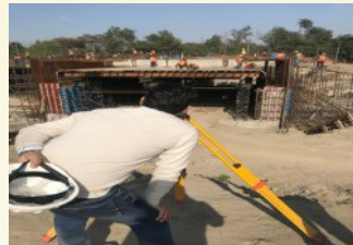
Underpasses / Tunnel works in Pragati Maidan- PWD, New Delhi