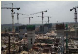
India International Convention & Expo Centre, Dwarka-New Delhi