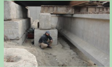
Load Test on Prestressed Concrete I Girder