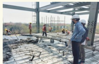
Non-Residential Buildings using Pre-Engineered Construction Technology at KG Marg and Africa Avenue, Delhi