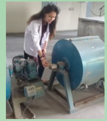
Abrasion Value Test for Aggregate