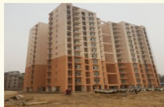
Quarters at Jasola- DDA, Delhi