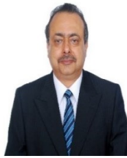
Shri Vivek Agnihotri