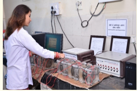
Rapid Chloride Penetrability Test for concrete Samples to study the chloride ions penetrability.

Nondestructive Testing and Distress Investigation Lab with state of the art equipment such as digital Rebound Hammer, UPV tester, Corrosion Analyzer, Endoscopy, Pile Integrity Tester, Ground Penetrating Radar, Impact Echo Tester etc.