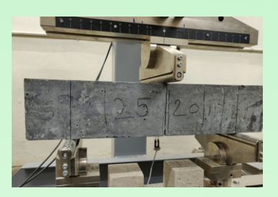
Testing of notched beam in progress for the study of fracture behaviour of High Strength Concrete