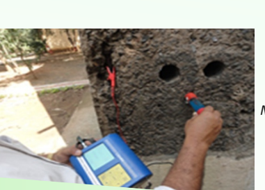
Half-cell Potential Measurement of Corrosion Damaged Structure