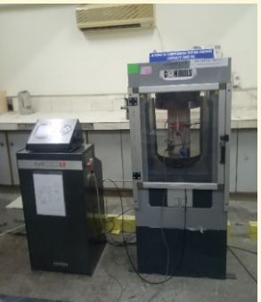
Test for Stress Strain Characteristics in progress for High Strength Concrete