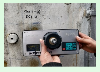
Pull-Off Test Being done to check bonding of PMM with substrate concrete