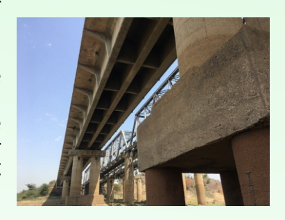
Condition Assessment of RCC Bridges