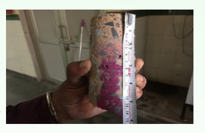
Carbonation depth being measured on freshly extracted core at site