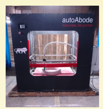
Lab scale 3D concrete printer

To enhance the experimental capability of the centre, several testing equipment related to study of cement and concrete characteristics and its behavior have been added. These equipment are procured under plan grant for different R&D and Sponsored Projects. The laboratory comprises of advance equipment for testing mechanical and durability parameter of various research projects.