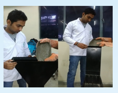
V-Funnel & L-Box Test for SCC