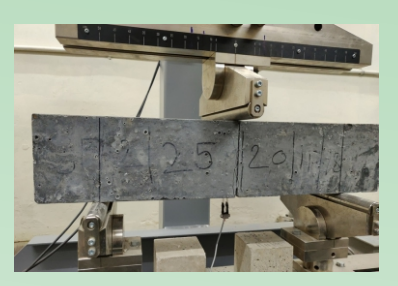
Testing of notched beam in progress for the study of fracture behaviour of High Strength Concrete