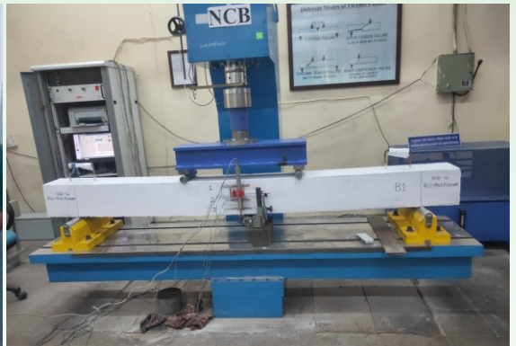
Flexural test setup for Geopolymer Reinforced Concrete Beams (In Flexure)