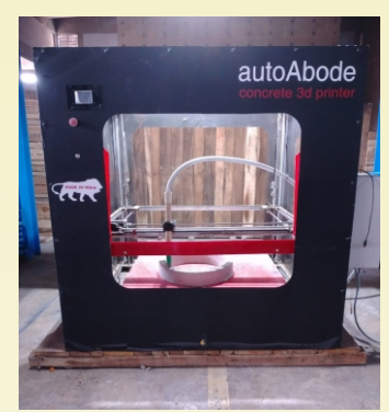
Lab scale 3D concrete printer

To enhance the experimental capability of the centre, several testing equipment related to study of cement and concrete characteristics and its behavior have been added. These equipment are procured under plan grant for different R&D and Sponsored Projects. The laboratory comprises of advance equipment for testing mechanical and durability parameter of various research projects.