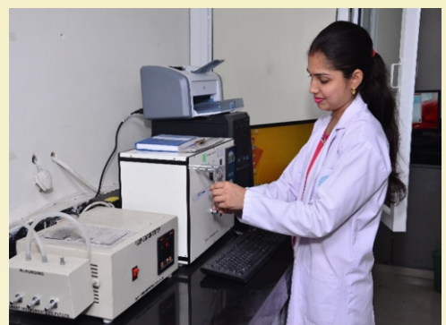
BET Apparatus for determining fineness of ultra-fine powder materials such as silica fume, metakoaline, ultrafine fly ash, ultrafine slag etc.