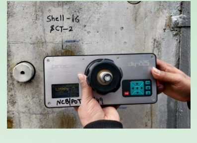
Pull-Off Test Being done to check bonding of PMM with substrate concrete