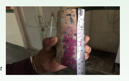
Carbonation depth being measured on freshly extracted core at site