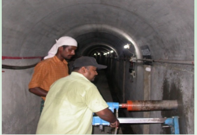
Concrete Core extraction of 150 mm diameter & 1 metre length from gallery of Gravity Dam