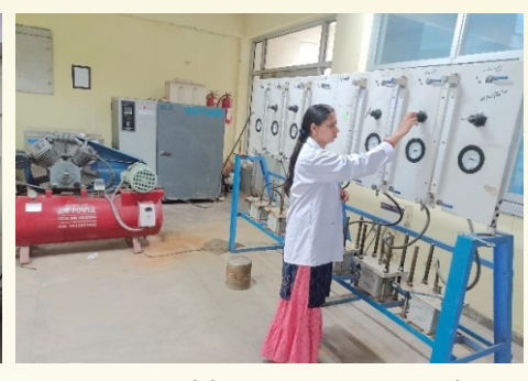
Water Permeability Test on concrete samples.