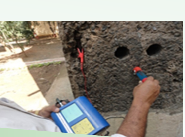
Half-cell Potential Measurement of Corrosion Structure