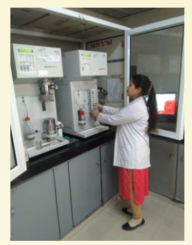
Mercury Intrusion Porosimeter test is used to study the pore size distribution and porosity of aggregate, concrete and mortar.