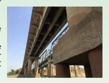
Condition Assessment of RCC Bridges