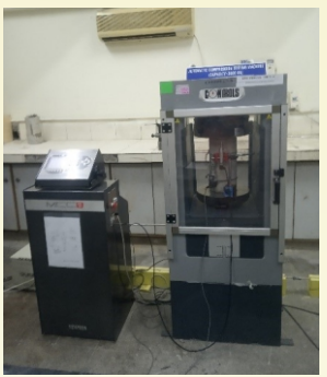
Test for Stress Strain Characteristics in progress for High Strength Concrete